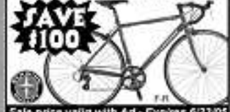
SAVE 100 Sale price valid with Ad - Expires 6/23/05