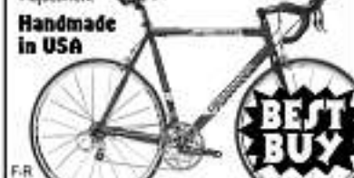
Handmade in USA BEST BUY